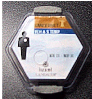
Dosimeter – Badge