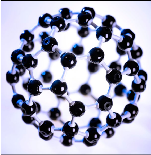
An example of a nanoparticle is a buckyball or fullerene.